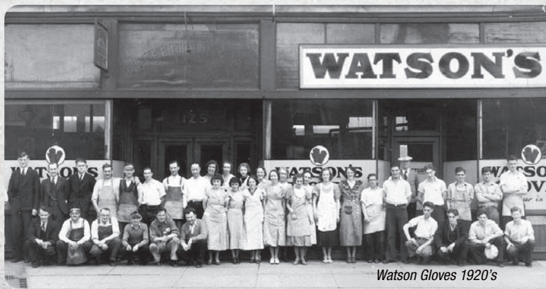
Watson Gloves 1920's

Innovation We commit to staying one step ahead of our customers; anticipating their needs and bringing the most advanced gloves for just about any job imaginable.